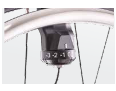
Push-rim Using the push-rim activates the motors for assistance. The sensitivity can be adjusted in just 7 steps.