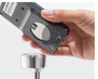
Holder for ECS remote control With magnetic locking mechanism for mounting on the wheelchair.