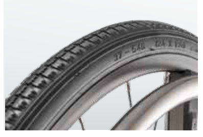
Tyre options Several tyre options are available (Rightrun 1", Marathon Plus 1", ProSpeed 1" made of PU, Airless 1 3/8" with PU-inlet)

Push-rim options Several push-rim options are available always providing a perfect grip (stainless steel, rubber coated, Curve L, Quadro mit Tetra-Gripp coating)