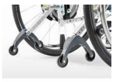
Anti-tip supports With jack-up function. Adjustable in height, angle and length.