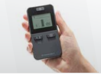
ECS remote control Indicates the health of the batteries and allows turning e-motion on and off from a seated position. Provides two assist levels and activates the roll-back delay.

Easy to detach from wheelchair, available in diameters 22", 24" and 26".