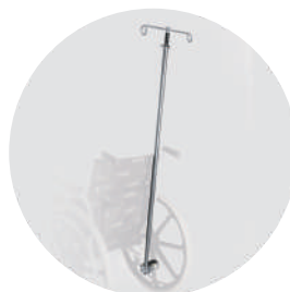
I.V. Pole Holder