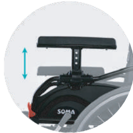
Flip-back, Height Adjustable Armrests