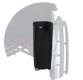
Oxygen Bottle Holder