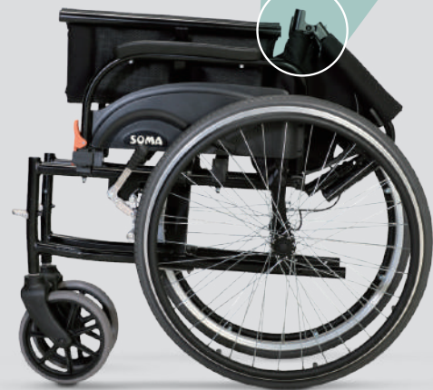
▲ Black Frame, 18" Seat Depth, 24" Rear Wheel With Folding Backrest

The Curved Line Design helps guide the seat upholstery into a nice and neat fold. Quick-Release Rear Wheels allow lighter carrying weight and smaller storage space.